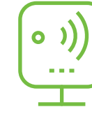
Switches, Sensors, Load Controllers